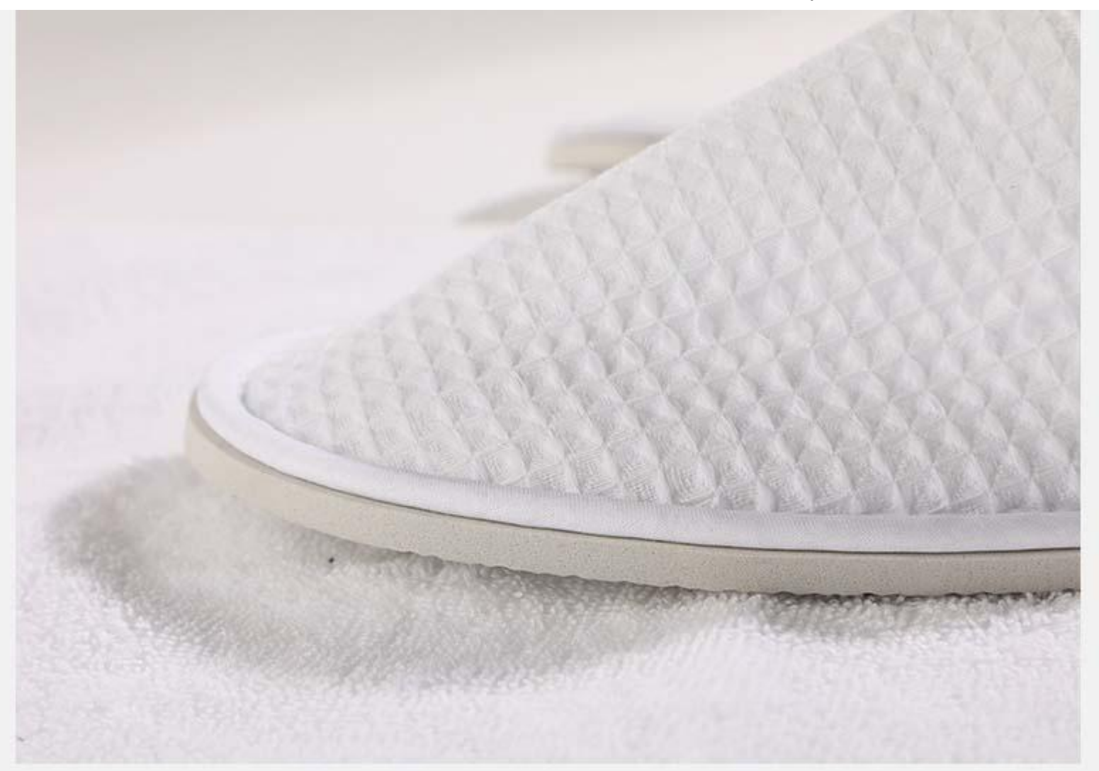
6MM thick sole